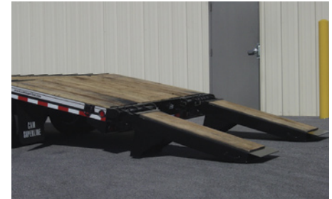
Wood Filled Ramps