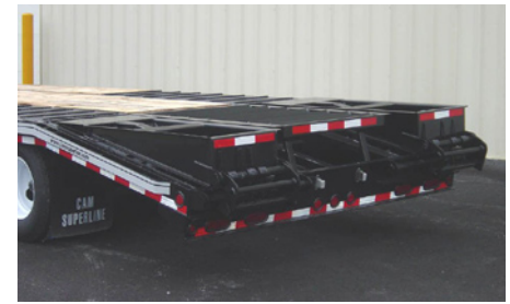
Self-Clean Beavertail w/Pop-up Center & Self-Clean, Self-Leveling Ramp w/foot (optional)