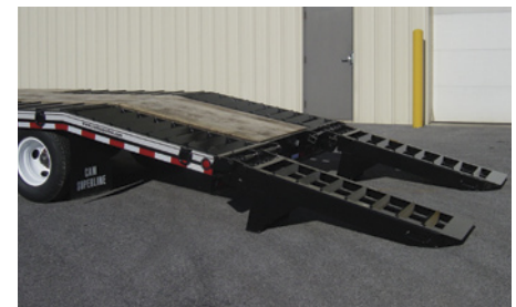
Self Clean Beavertail & Ramps (optional)