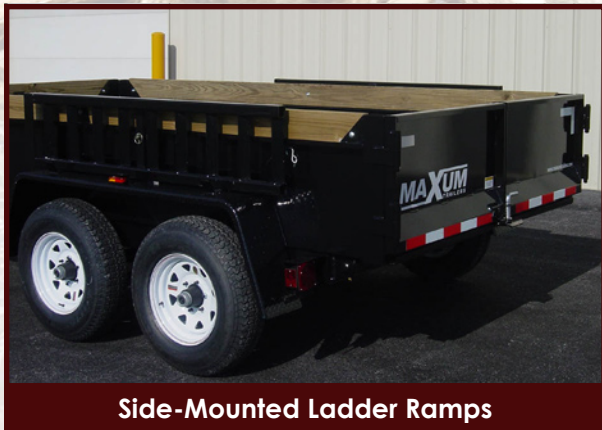
Side-Mounted Ladder Ramps