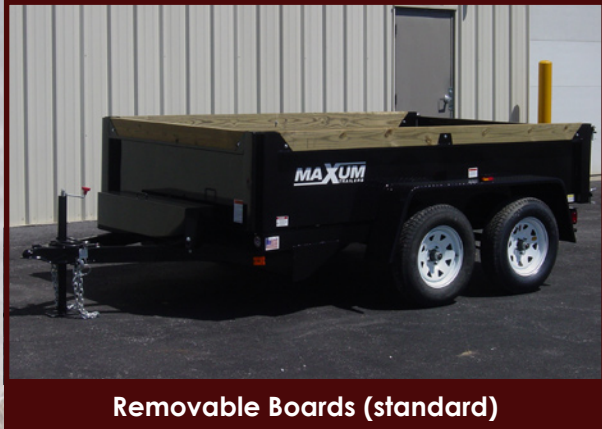
Removable Boards (standard)